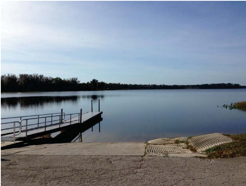
A nice view of the dock/boat ramp and Lake Dias - an absolutely beautiful day!

We quit around noon and enjoyed our “brown bag picnic” lunch in the pavilion....we told all kinds of operating tales and the food was great! But not as great as our friendship and outing! We commiserated over the bad propagation, talked about the recent NAQCC Sprint, and of course, talked about the “good old days”. Everything was better back then! 😊 (Sure it was..... Hi hi hi ....)