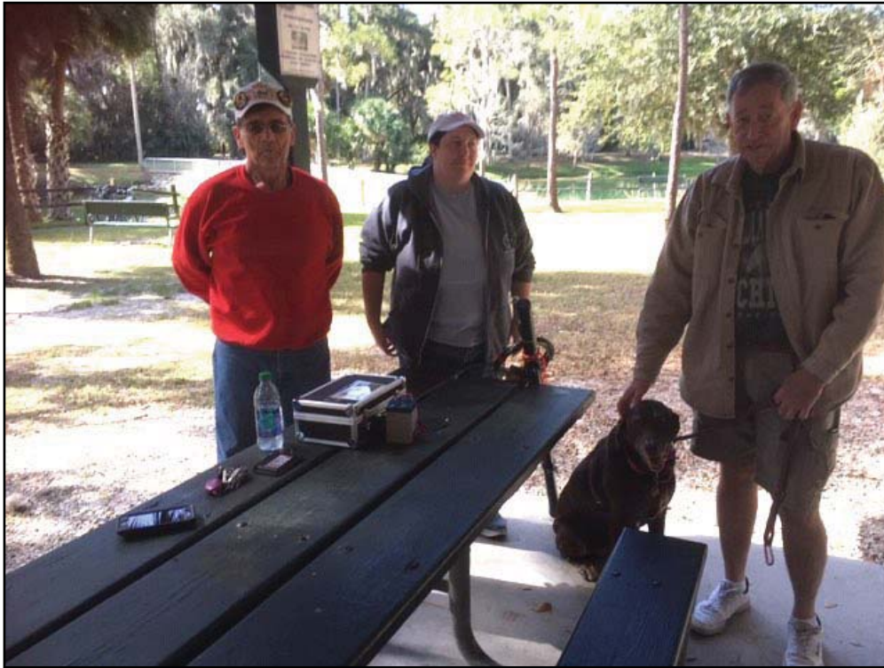
K3RLL KM4SBQ Bailey KD4JS

With a break in the bitter winter weather that has plunged our corner of Florida into 50 degree days, today we were blessed with an abundance of sunshine and temperatures in the mid 70s. The warmer attired shown below reflects the arrival temperatures way down into the upper 60s.